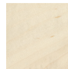
MAPLE, BLEACHED MATTE POLY

GENERALLY, PERSONALIZATIONS CAN INCLUDE CHANGES IN: