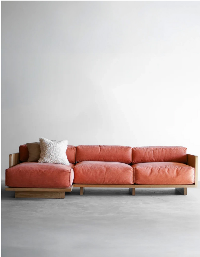
// SHOWN IN TWO PIECE SECTIONAL

PERFORMANCE FABRIC + DOWN + OAK HARDWAX OIL FINISH + PATINATED STEEL