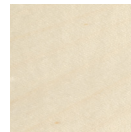
MAPLE, BLEACHED MATTE POLY