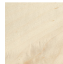
MAPLE, BLEACHED MATTE POLY