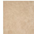
SALOON FRENCH VANILLA